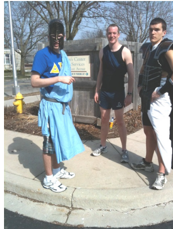
Our Finest Athletes