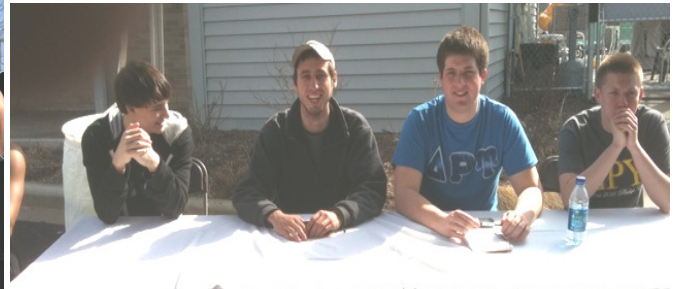
Sign Up Committee